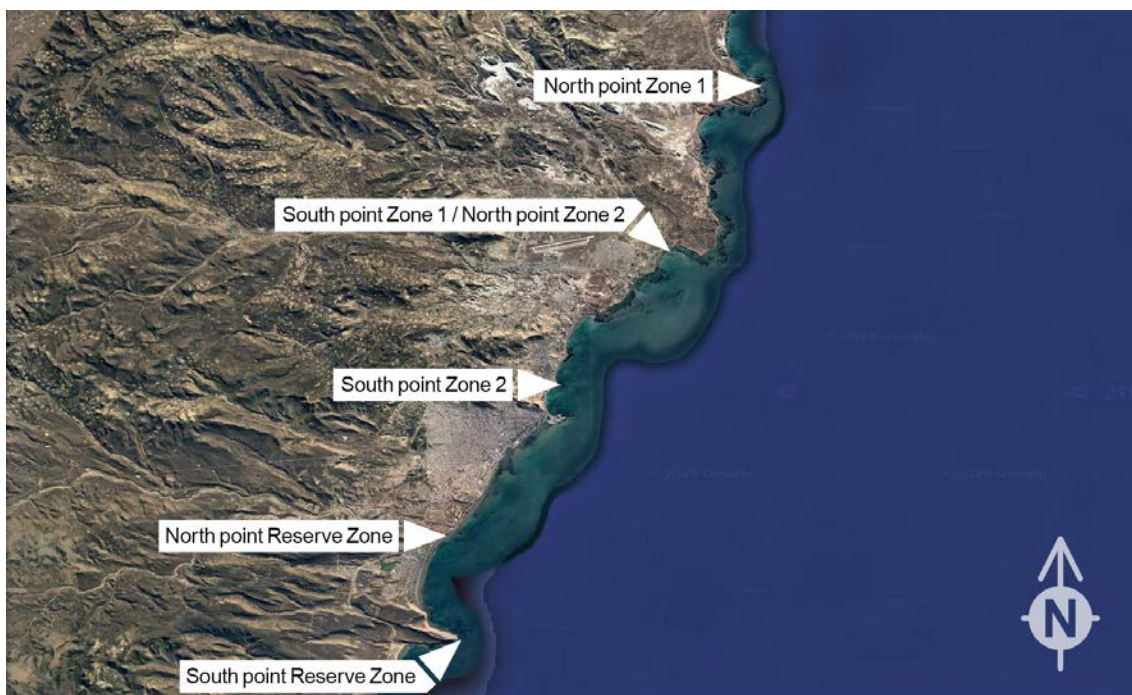
Map 1: Overview