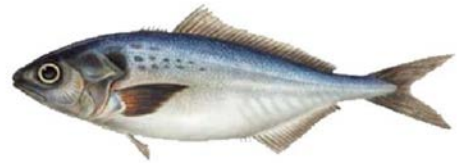
SABORIN ( Seriolella porosa )