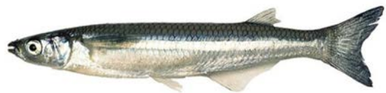
PEJERREY ( Odontesthes argentinensis )