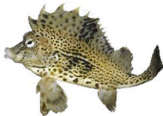
CHANCHITO ( Congiopodus peruvianus )