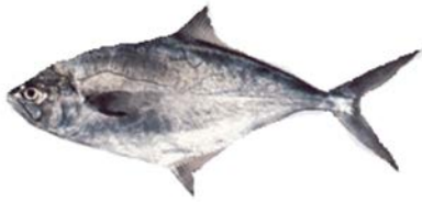
PALOMETA PINTADA ( Parona signata )