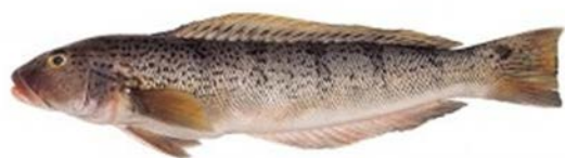
SALMÓN DE MAR ( Pseudoperca semifasciata )

Very IMPORTANT: Only 1 piece per athlete, per day of competition will be valid for this event.