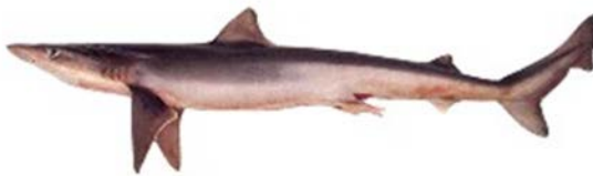
TIBURÓN GATUZO / CAZÓN ( Galeorhinus galeus )