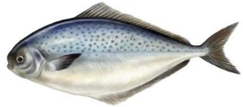
PAMPANITO ( Stromateus brasiliensis )