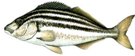
TRUMPETER ( Latris lineata )