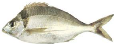
PAPAMOSCAS O CASTAÑETA ( Nemadactylus bergi )