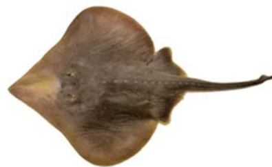
CHUCHO ( Sympterygia acuta )