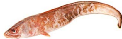
ABADEJO ( Genypterus blacodes )