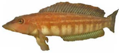
TURCO ( Pinguipes brasilianus )