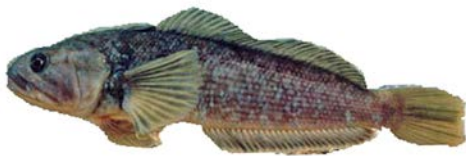
SAPO ( Paranothotenia angustata )