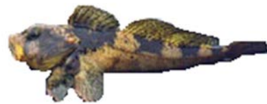
VIEJA ( Bovichtus argentinus )