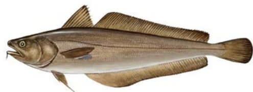
BRÓTOLA ( Salilota australis )