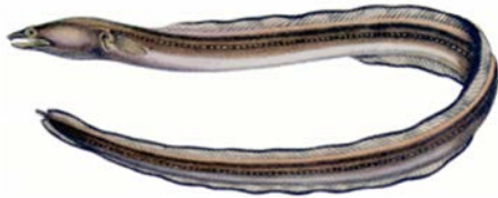
CONGRIO ( Conger orbignyanus )