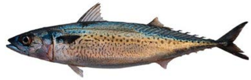
MAGRÚ ( Scomber japonicus )