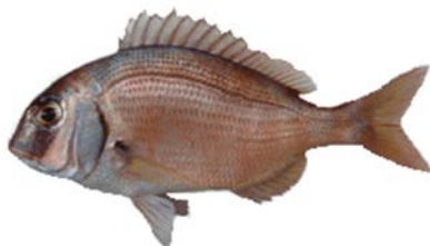
BESUGO ( Pagrus pagrus )