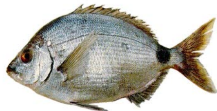
SARGO ( Diplodus argenteus argenteus )