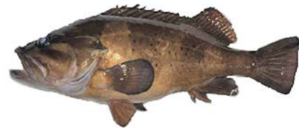
MERO ( Acanthistius brasilianus )