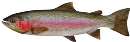
TRUCHA ( Orconrhyinchus mykiss )