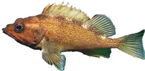
ESCRÓFALO ( Sebastes Oculatus )