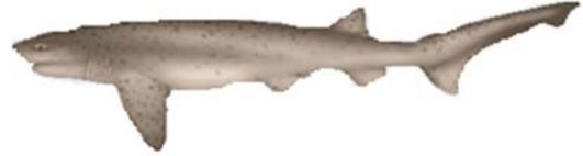
TIBURÓN GATOPARDO ( Notorynchus cepedianus )