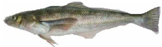
RÓBALO ( Eleginops maclovinus )