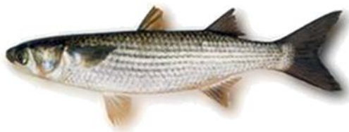
LISA ( Mugil cephalus )