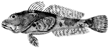
PEZ PIEDRA ( Cottoperca gobio )