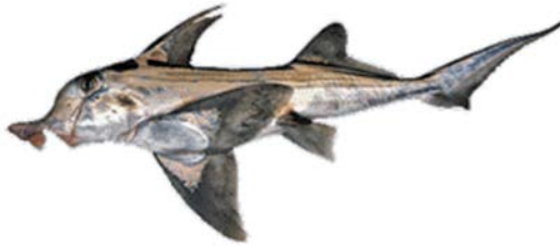
PEZ ELEFANTE ( Callorhynchus callorhynchus )