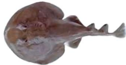
RAYA TORPEDO ( Discopterygia tschudi )